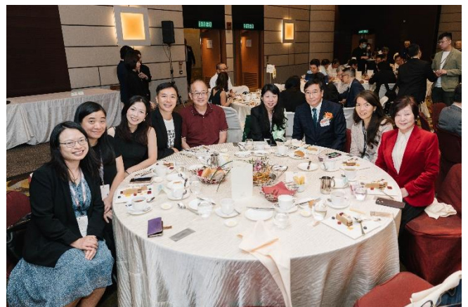
Networking luncheon with sponsors, guests, speakers and HKETA members.