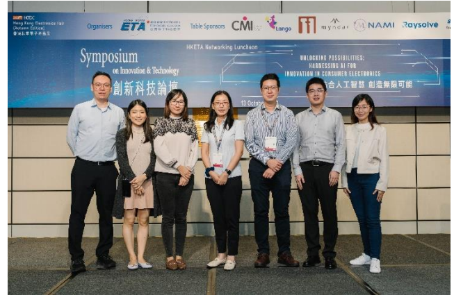
Group photo of Table + Bronze Sponsor: NAMI