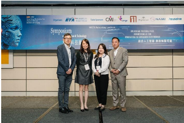
A group photo of Table Sponsor: Megasoft Ltd.