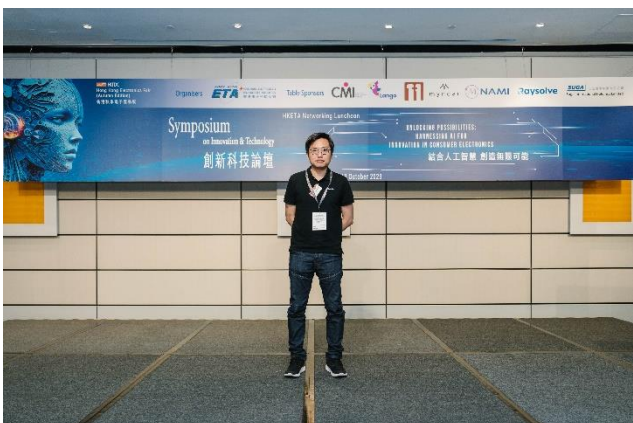
A photo of Table Sponsor: Raysolve Technology