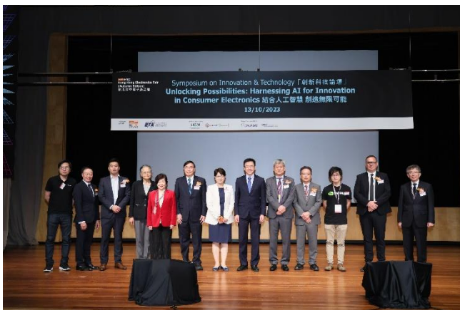
A group photo with GOH, Moderator and speakers