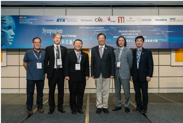
Group photo of Silver Sponsor: LSCM