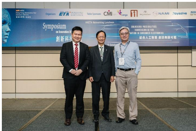
Group photo of Table + Bronze Sponsor: SUGA