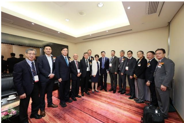
Group photo of speakers with GOH before the Symposium commenced