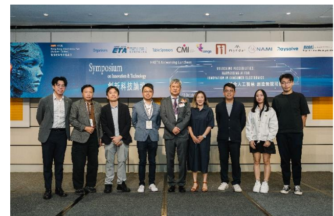
Group photo of Table Sponsor: Lango Innovation