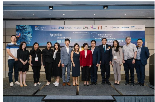
Group photo of Table Sponsor: CMI-Hong Kong