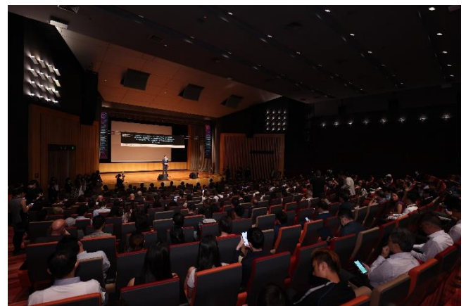
Over 1000 attendances at the Theatre 1