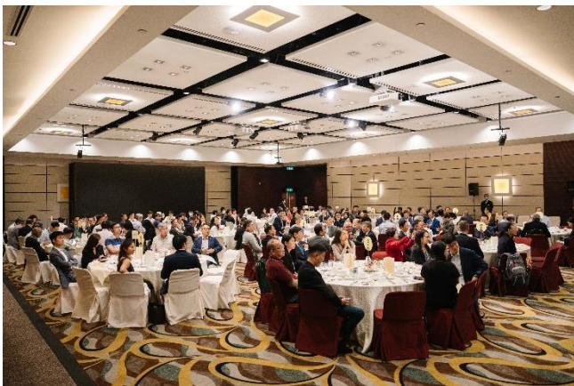
Networking luncheon with 15 tables