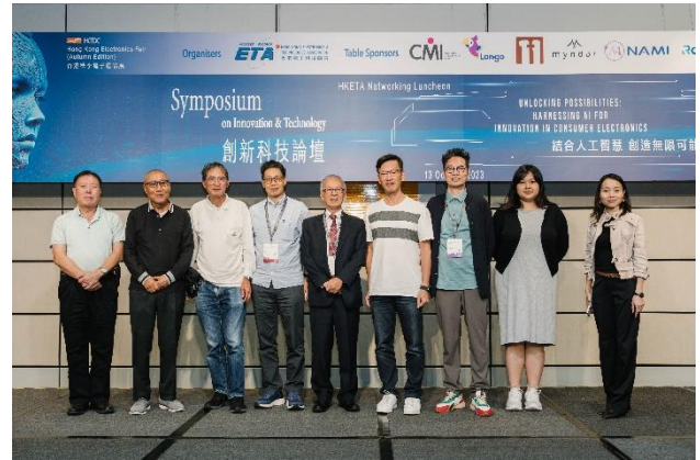
A group photo of Table Sponsor: Micom Tech Ltd.